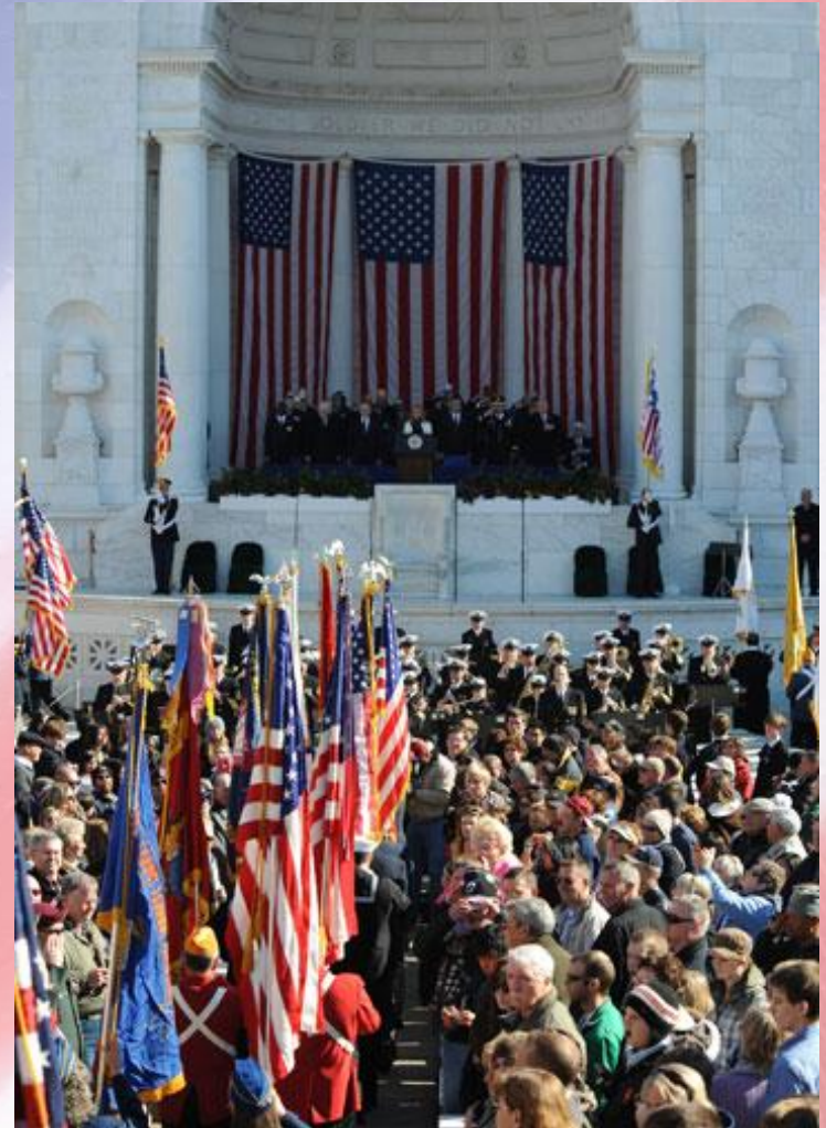
Photo courtesy of the U.S. Department of Veterans Affairs http://www1.va.gov/opa/vetsday/08images/9.jpg