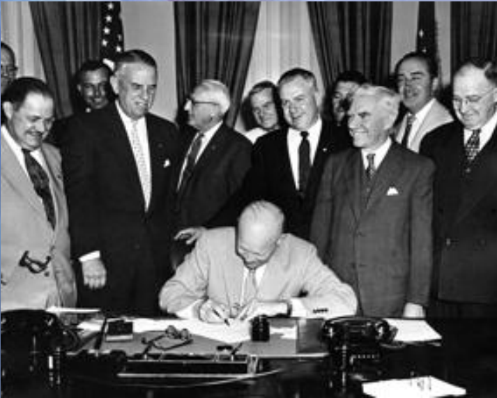
Photo courtesy of the U.S. Department of Veterans Affairs http://www1.va.gov/opa/vetsday/vetdayhistory.asp